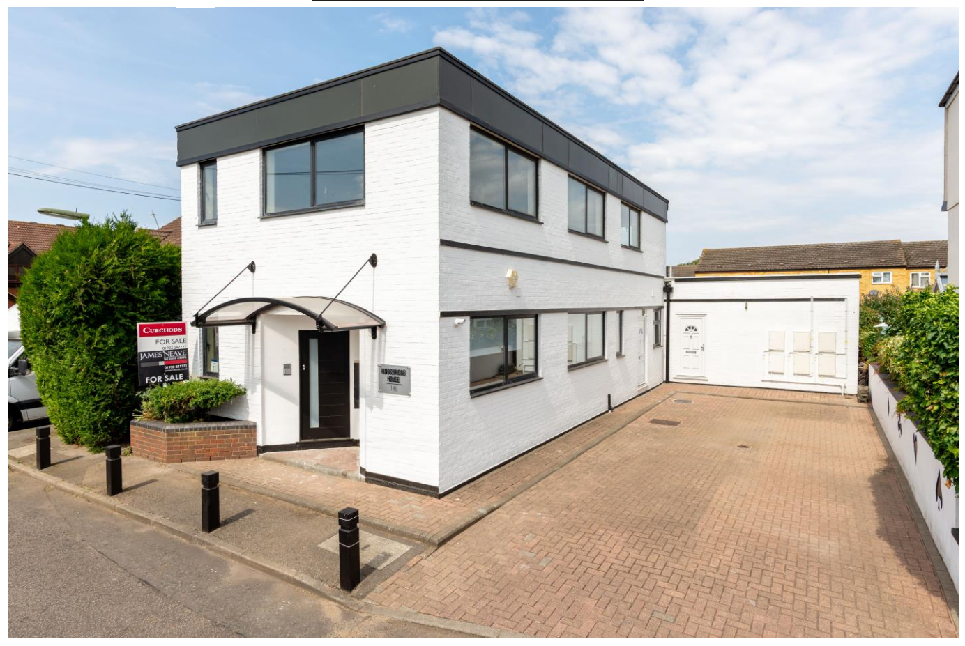
1 Kingsbridge House Kingsbridge Road Walton-On-Thames Surrey KT12 2BH £1300pcm + Initial deposit